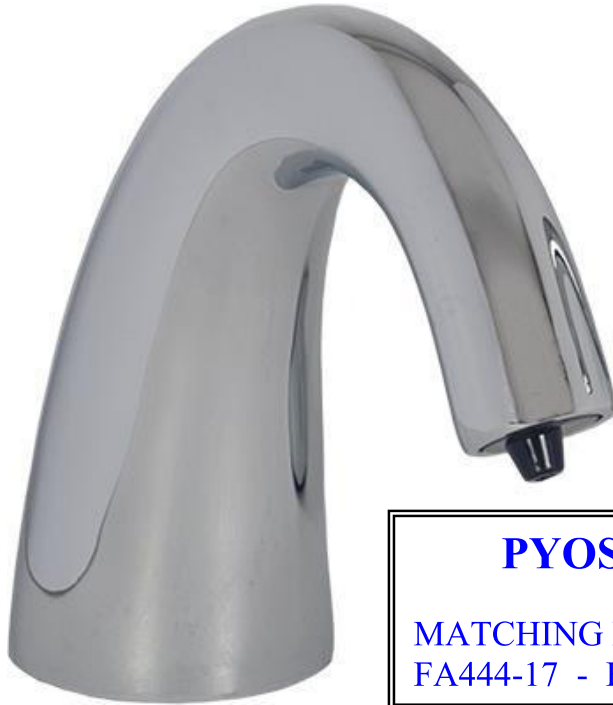
PYOS-17 MATCHING FAUCET FA444-17 - FA400-118